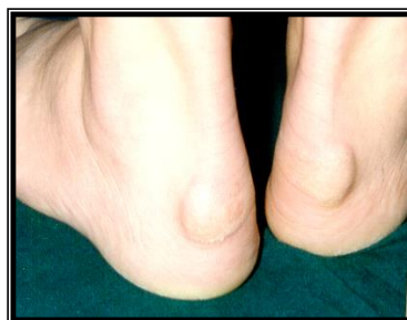
Lumps and Bumps